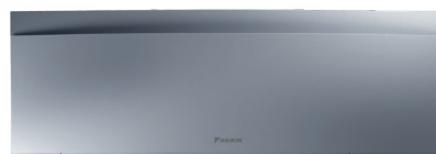
DAIKIN EMURA FTXJ-AS SILVER