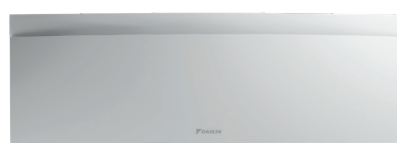
DAIKIN EMURA FTXJ-AW MATT WHITE