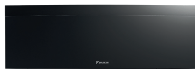
DAIKIN EMURA FTXJ-AB MATT BLACK